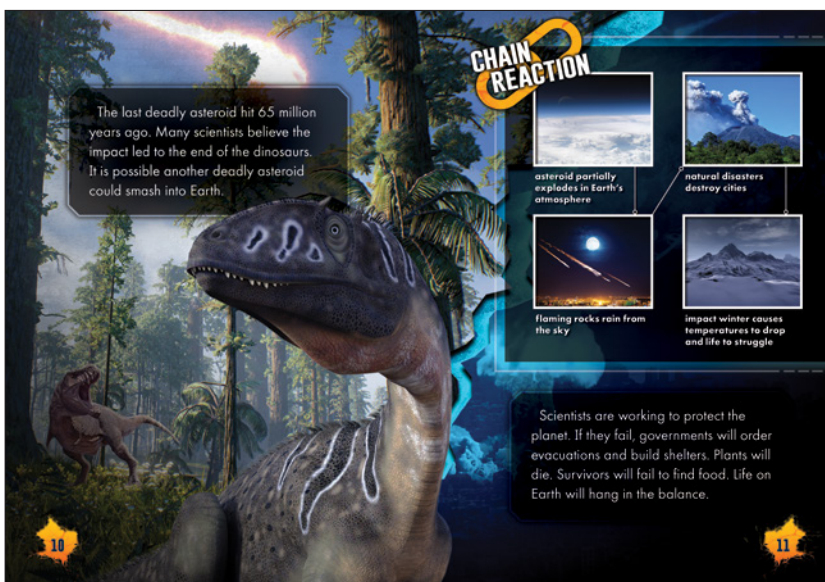
Sample spread from Asteroid Impact